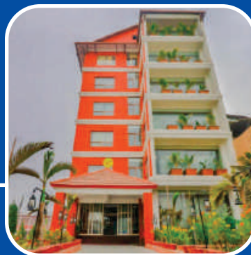
Ratna Hotel, Biratnagar