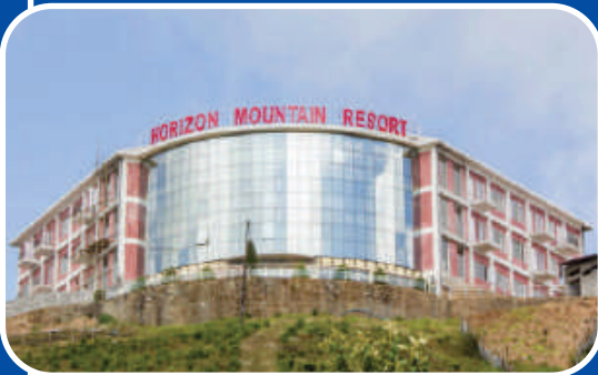
Horizon Mountain Resort, Hile