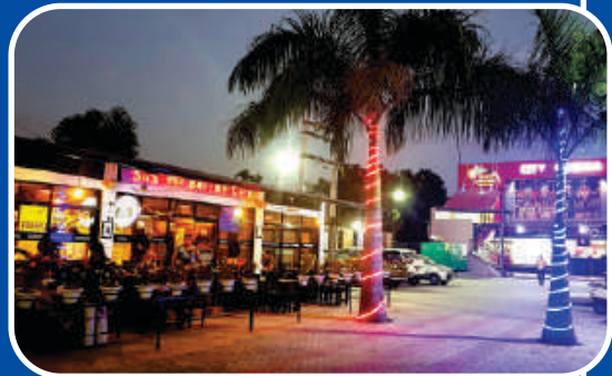
SASTHM Bakery Cafe, Biratnagar